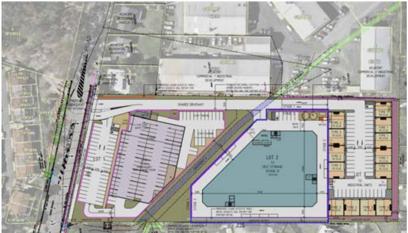
Figure 2 – Currently proposed project

and technology industry and warehouse. Non-industrial uses supporting industrial activities and their employees are also expected development categories.