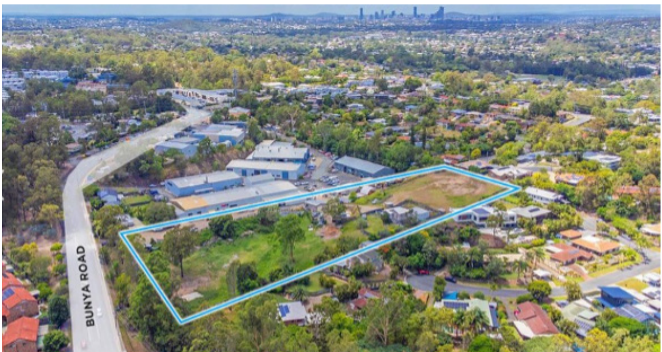
Figure 1 – Aerial view of undeveloped site

With a Light Industry zoning, the proposed uses are all noted as 'accepted development – subject to requirements' – the Council's expected development use which does not therefore require public notification. Rather, a conventional development application is submitted to the Council with the proposed development's plans and specifications for approval. The Light Industrial zone contemplates a range of low impact and low intensity industrial and business uses among which are included low impact industry, research